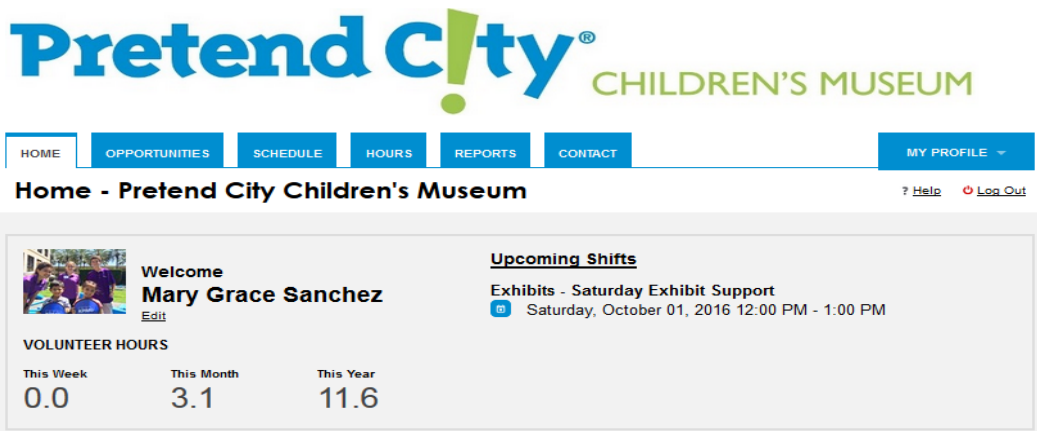
Snapshot of Better Impact

Through this software, each active volunteer will be given a personal profile page where they can search and sign-up for available shifts and print out volunteer schedules. Since this is a web-based system, you may access your profile and Volunteer Impact from any device with Internet capabilities (i.e., laptops, desktops, and phone). All active volunteers create an account with a custom login, which they may use to sign-in on the computers located in the staff workroom. They may also clock in from their phones using the Better Impact website. Volunteers must clock in and out before and after every shift to accurately track volunteer hours.